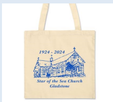
Centenary Tote Bag - $5