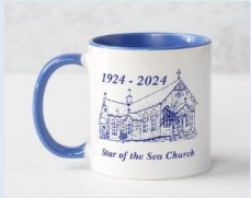
Centenary Coffee Mug - $15

Commemorative items available to purchase: