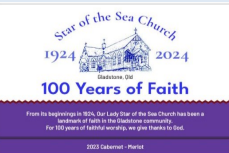
Centenary Cabernet Merlot - $15