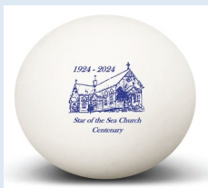
Centenary Handball - $5

Please contact the parish office to purchase your keepsake of the centenary: