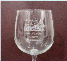
Centenary Wine Glass - $15