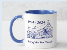
Centenary Coffee Mug - $15

Commemorative items available to purchase: