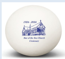
Centenary Handball - $5

Please contact the parish office to purchase your keepsake of the centenary: P: 49721025 E: sosgladstone@rok.catholic.net.au