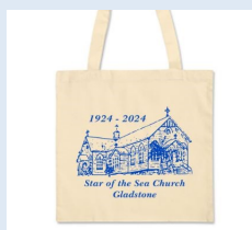
Centenary Tote Bag - $5