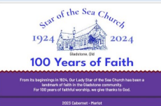
Centenary Cabernet Merlot - $15