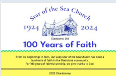
Centenary Chardonnay - $15