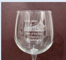
Centenary Wine Glass - $15