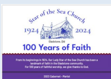
Centenary Cabernet Merlot - $15