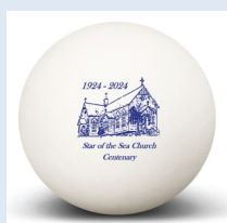
Centenary Handball - $5

Please contact the parish office to purchase your keepsake of the centenary