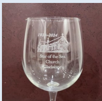
Centenary Wine Glass - $15