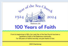
Centenary Chardonnay - $15