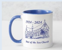
Centenary Coffee Mug - $15

Commemorative items available to purchase: