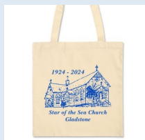
Centenary Tote Bag - $5