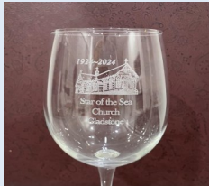
Centenary Wine Glass - $15