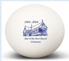
Centenary Handball - $5

Please contact the parish office to purchase your keepsake of the centenary