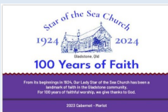
Centenary Cabernet Merlot - $15