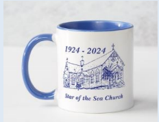
Centenary Coffee Mug - $15

Commemorative items available to purchase: