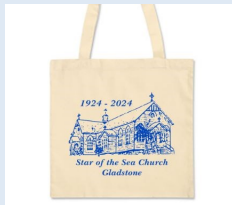
Centenary Tote Bag - $5