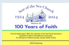
Centenary Chardonnay - $15