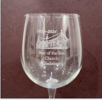
Centenary Wine Glass - $15