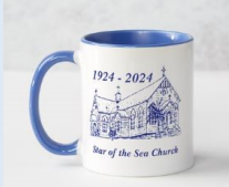
Centenary Coffee Mug - $15

Commemorative items available to purchase: