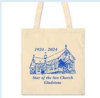
Centenary Tote Bag - $5