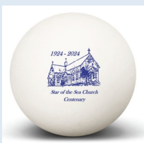
Centenary Handball - $5

Please contact the parish office to purchase your keepsake of the centenary