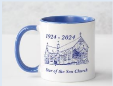
Centenary Coffee Mug - $15

Commemorative items available to purchase: