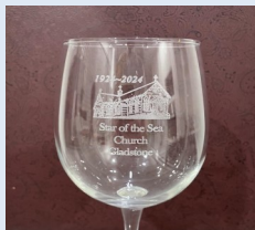
Centenary Wine Glass - $15