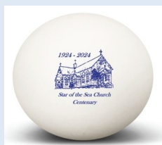
Centenary Handball - $5

Please contact the parish office to purchase your keepsake of the centenary: