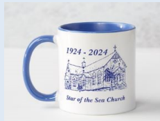
Centenary Coffee Mug - $15

Commemorative items available to purchase: