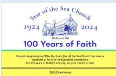
Centenary Chardonnay - $15