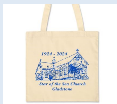
Centenary Tote Bag - $5