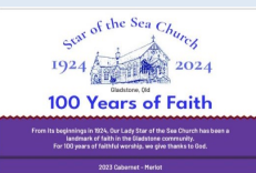
Centenary Cabernet Merlot - $15