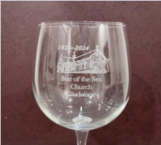
Centenary Wine Glass - $15