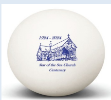
Centenary Handball - $5

Please contact the parish office to purchase your keepsake of the centenary