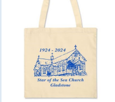
Centenary Tote Bag - $5