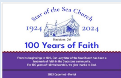
Centenary Cabernet Merlot - $15